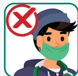
Under your nose