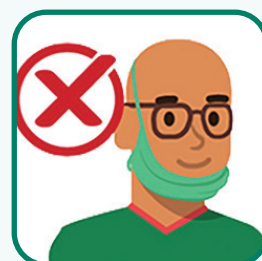
On your Chin