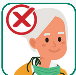
Around your neck