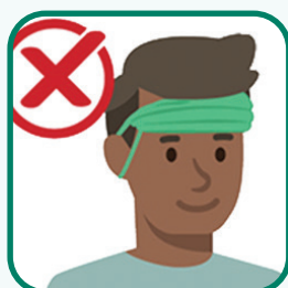
On your forehead