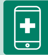
NURSE ADVICE HOTLINE

Doctor's Office Visits Outpatient services and doctor's office visits are covered with no copay from you.